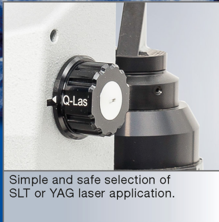
Simple and safe selection of SLT or YAG laser application.