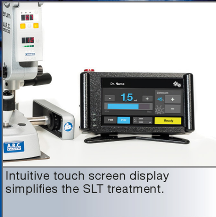
Intuitive touch screen display simplifies the SLT treatment.

ERGONOMICS AND DURABILITY IN AN INNOVATIVE DESIGN.