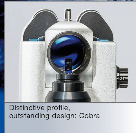
Distinctive profile, outstanding design: Cobra